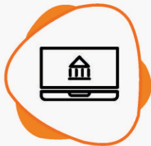
Activate Your Wallet Account