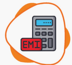
EMI Bill Pay