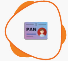
Pan Card ( UTI )