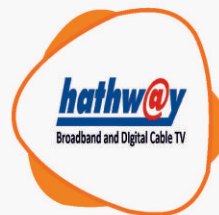
Hathway Cable Tv